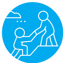
Friends on Staff Professional Mentors