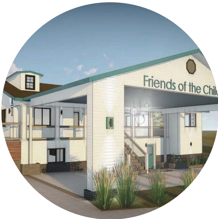
New clubhouse at 1515 Old Fort Road

Our capital campaign for a larger clubhouse launched in fiscal year 2022 and reached its goal of $1.5M thanks to many generous funders, including: